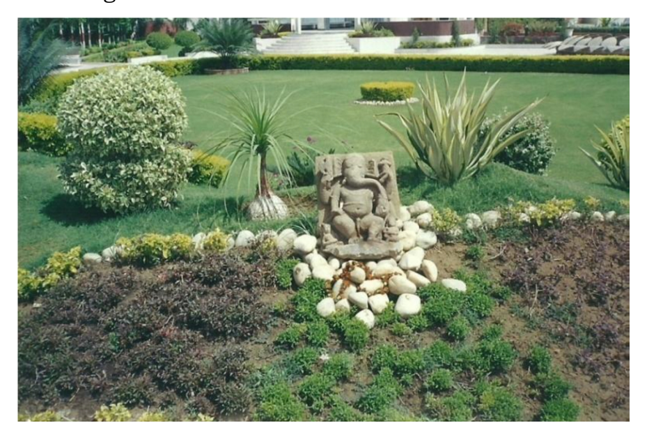
Ganeshji Idol at the Entrance