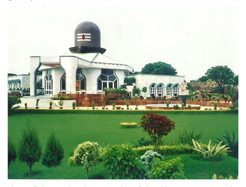
One of the Early Photographs of the Chattarpur Temple

temple. He had the lights switched on and as we went to switch on the pump for the waterfall, we saw snakes. As Guruji entered the temple, he asked, "Why haven't you turned on the waterfall?" "Guruji there are snakes sitting on the switch, we are scared to go in." We replied. "Go now and switch it on, the snakes have gone." We again went and saw there were no snakes and turned the pump on. "Jadon hi saap dekho ta hath jod ke Guruji da naam lo te oh chale jaange." - 'Whenever you see a snake, fold your hands and ask it to leave, it will leave without harming you." That day, I got my answer!